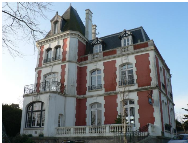
Image: Doenitz's forward headquarters at Kerneval near the Lorient submarine pens

The order has to be understood in terms of the context of the Laconia sinking, but also the wider culture and practice prevailing in the German submarine arm. Contrary to wartime British propaganda, German submariners did not routinely machine gun shipwrecked crews whose vessels had been destroyed. Indeed, the reality was quite the opposite. At the start of the war the German submarine arm had tried to abide by the spirit if not the letter of the 1936 London Submarine Protocol governing their operation in time of war. Under the protocol merchant ships were not to be sunk without warning and adequate provision made for their crews. Allowing crews to take to lifeboats and rafts was not considered adequate provision. In effect, observance of the London protocol took away the advantages of the submarine as a weapon of war. Despite this, in the early stages of the war German submariners did try to work within the spirit of the protocol.